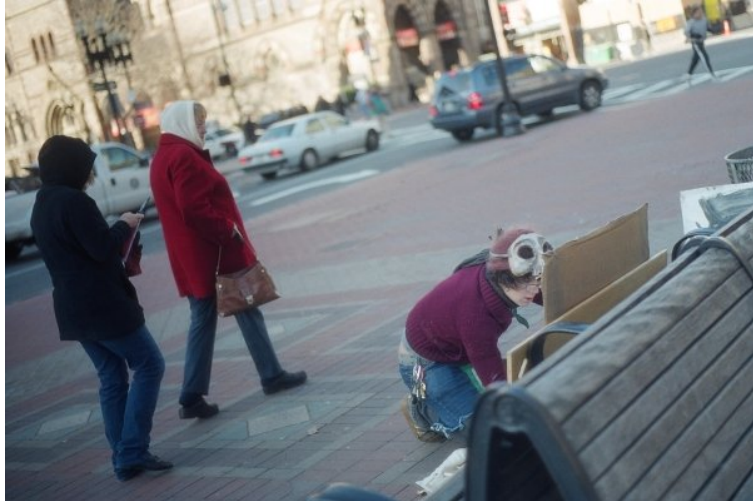
Above: Public Performance on Transgender Remembrance Day 2k8

“reflective and imaginative...an intimate and moving experience”